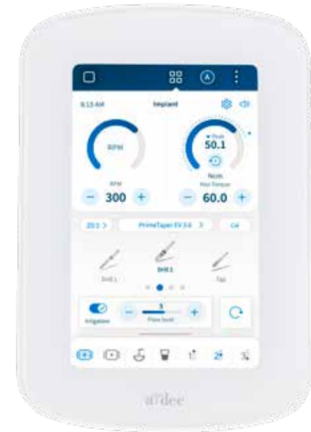
Touchscreen shows you real-time RPM, torque, and irrigation monitoring with preset workflows.