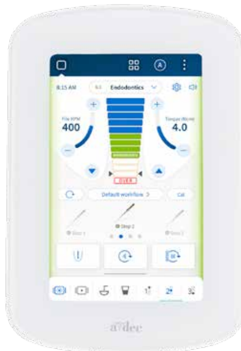
The integrated Midwest apex locator accurately identifies—and shows—the file position relative to the canal apex on the DS7 touchscreen as you work.